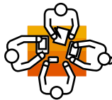
The Peer Network